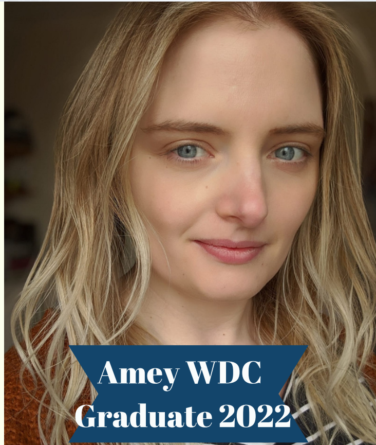
Amey WDC Graduate 2022